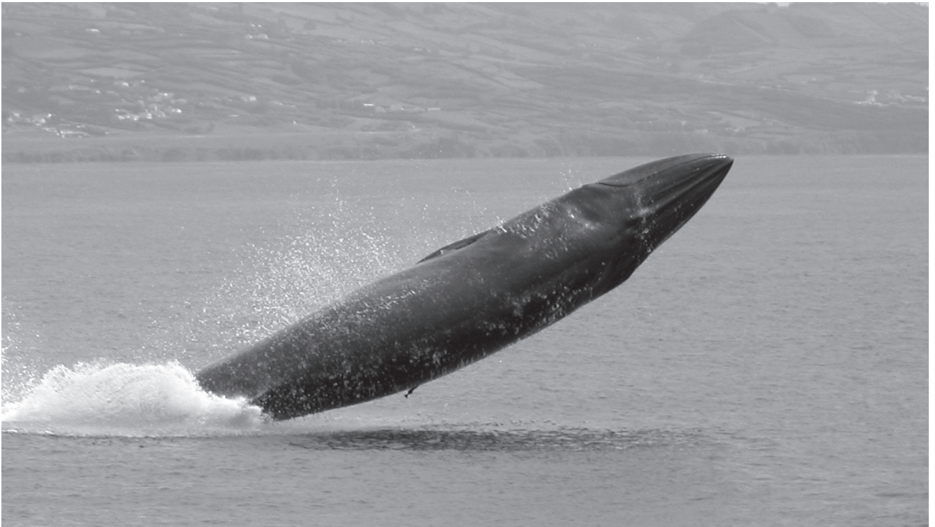
Figure 3. Breaching Bryde's whale showing the three longitudinal ridges on top of the rostrum.