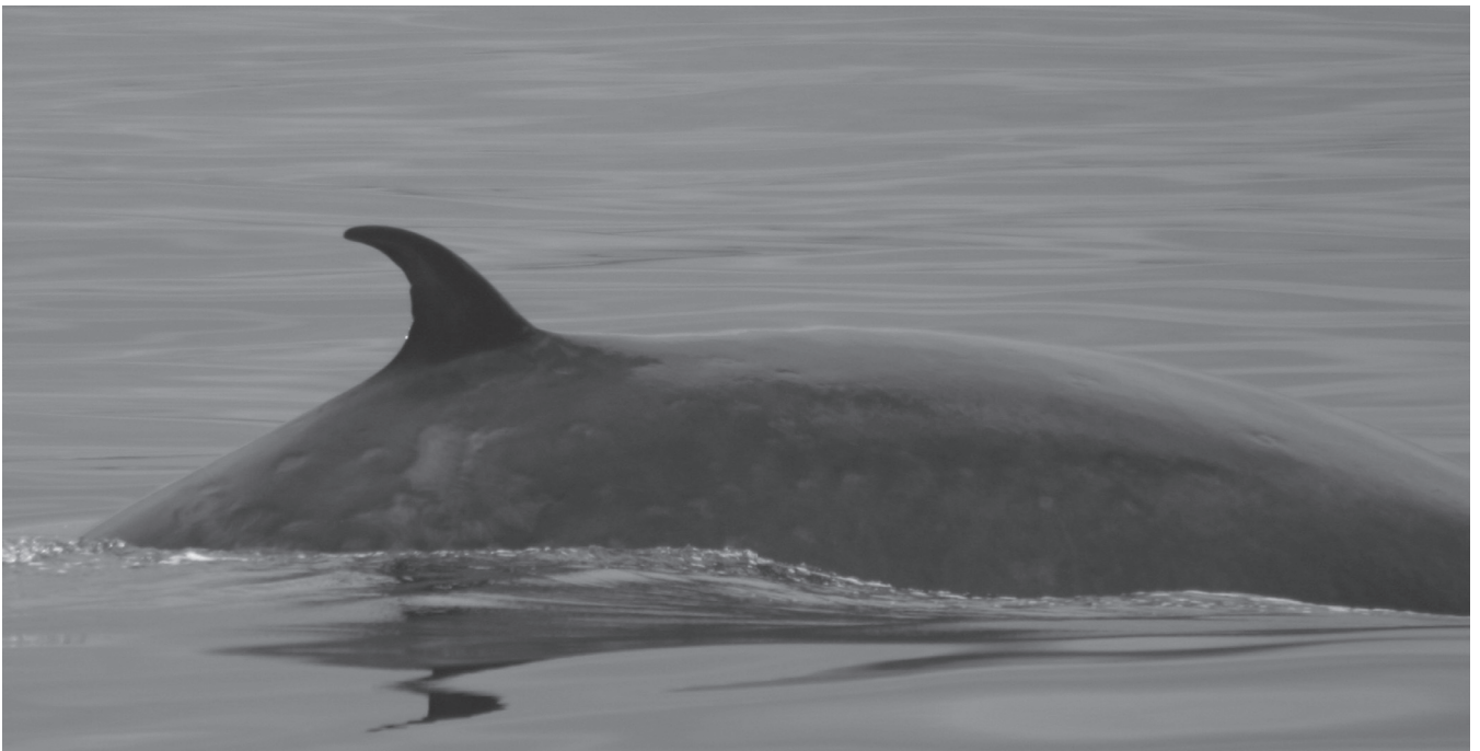
Figure 4. Cookie cutter scars.

the head and the three ridges were not seen, but the behaviour of the whales was similar to that observed from Bryde's whales on previous occasions and different to that generally observed from sei whales also seen in the Azores.